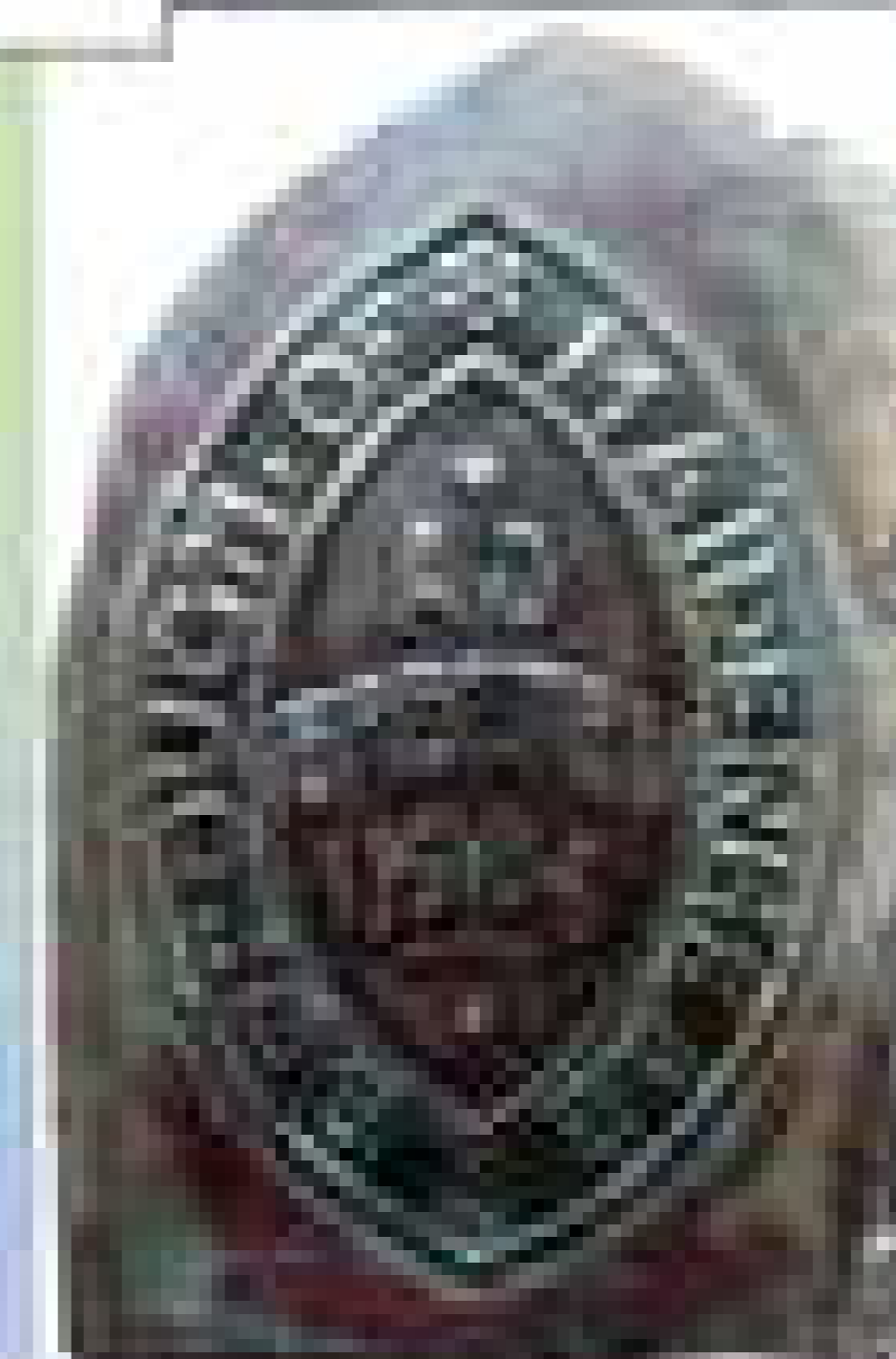
Plaque from Maidenhead Library gates.